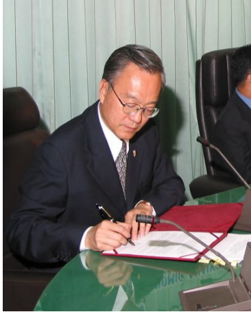
Author was signing R/D.

I would like also to reiterate the determination of the OAE in providing the accurate and updated statistical information to all parties concerned.