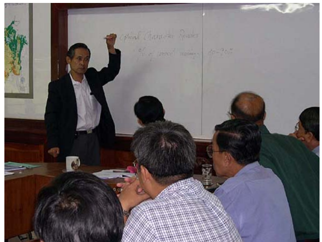
Author explained on the project at an ROAE.

We JICA Experts are honored to join the efforts of the Office of Agricultural Economics (OAE), Ministry of Agriculture and Cooperatives (MOAC) in improving its data and information through the Project on Agricultural Statistics and Economic Analysis Development (ASEAD) .